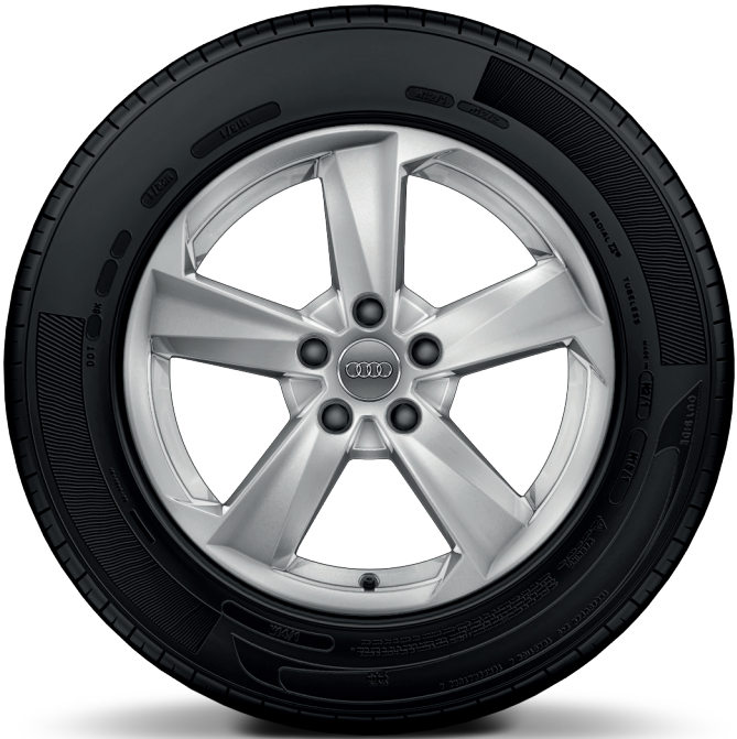
17” cast alloy wheels in 5-arm star style

4-cylindine inline spark-ignition engine with direct fuel injection and exhaust turbocharger 1,395 (4) 110 (150) / 5,000 - 6,000 250 / 1,500 - 3,500 Front-wheel drive 7-speed S tronic transmission 1,280 1,840 60 50 212 8.5 Sulphur-free RON 95 5.3 EU6